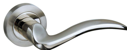
Product Finish Pictured: Satin Nickel / Polished Nickel